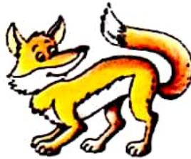
a f ox