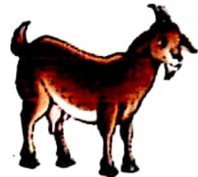
a g oa t