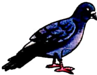
a p igeo n