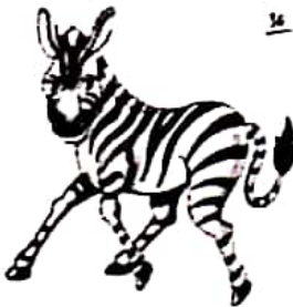
a z eb r a