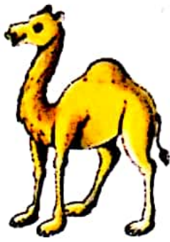
a ca m e l