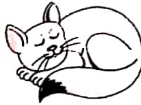
a c at