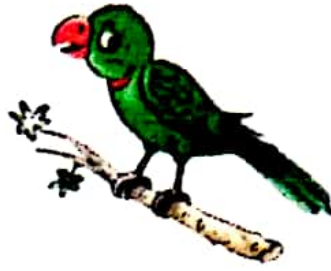
a p ar ro t