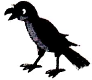
a c ro w